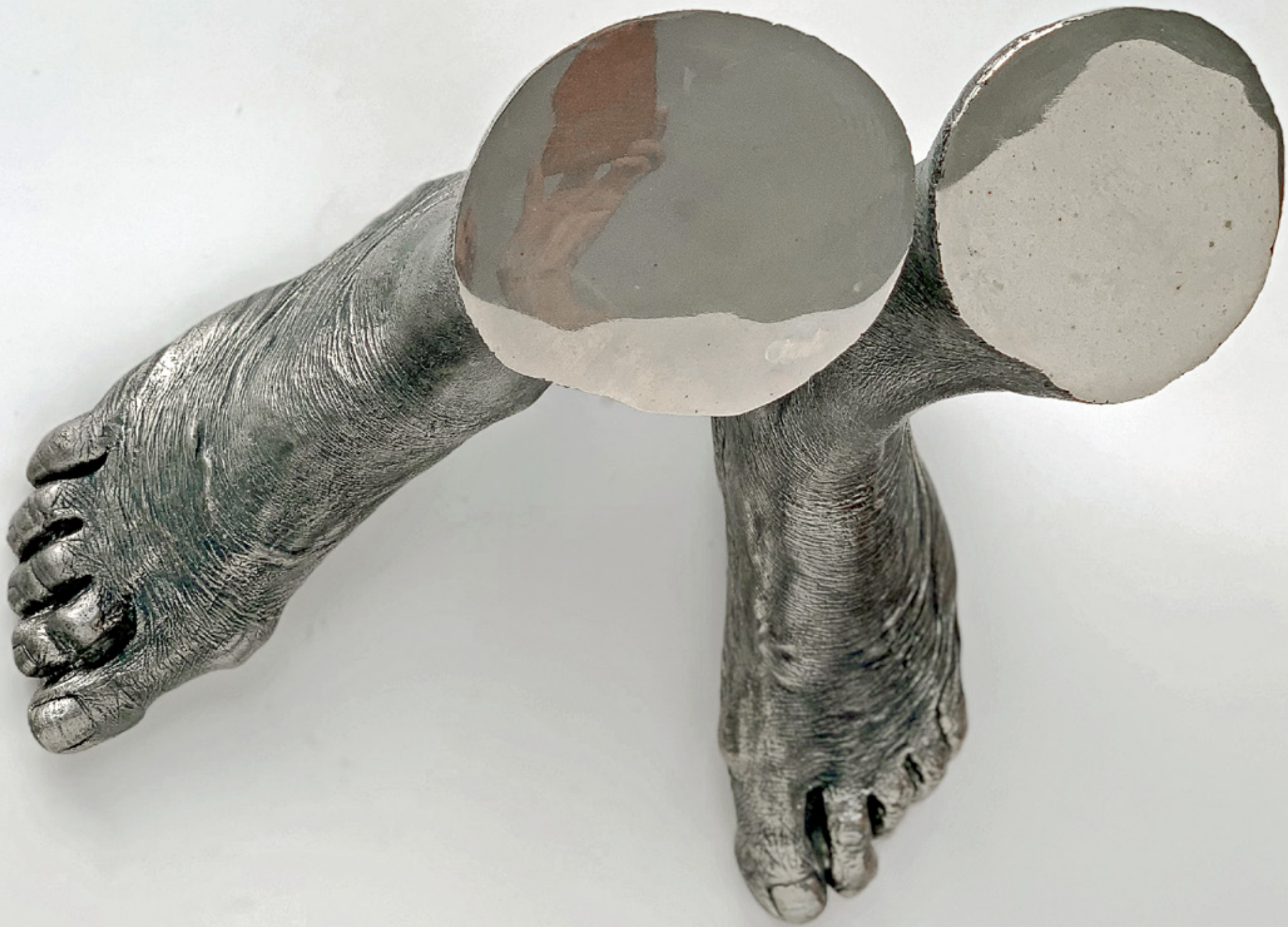
2020 FEET, nickel silver, natural size