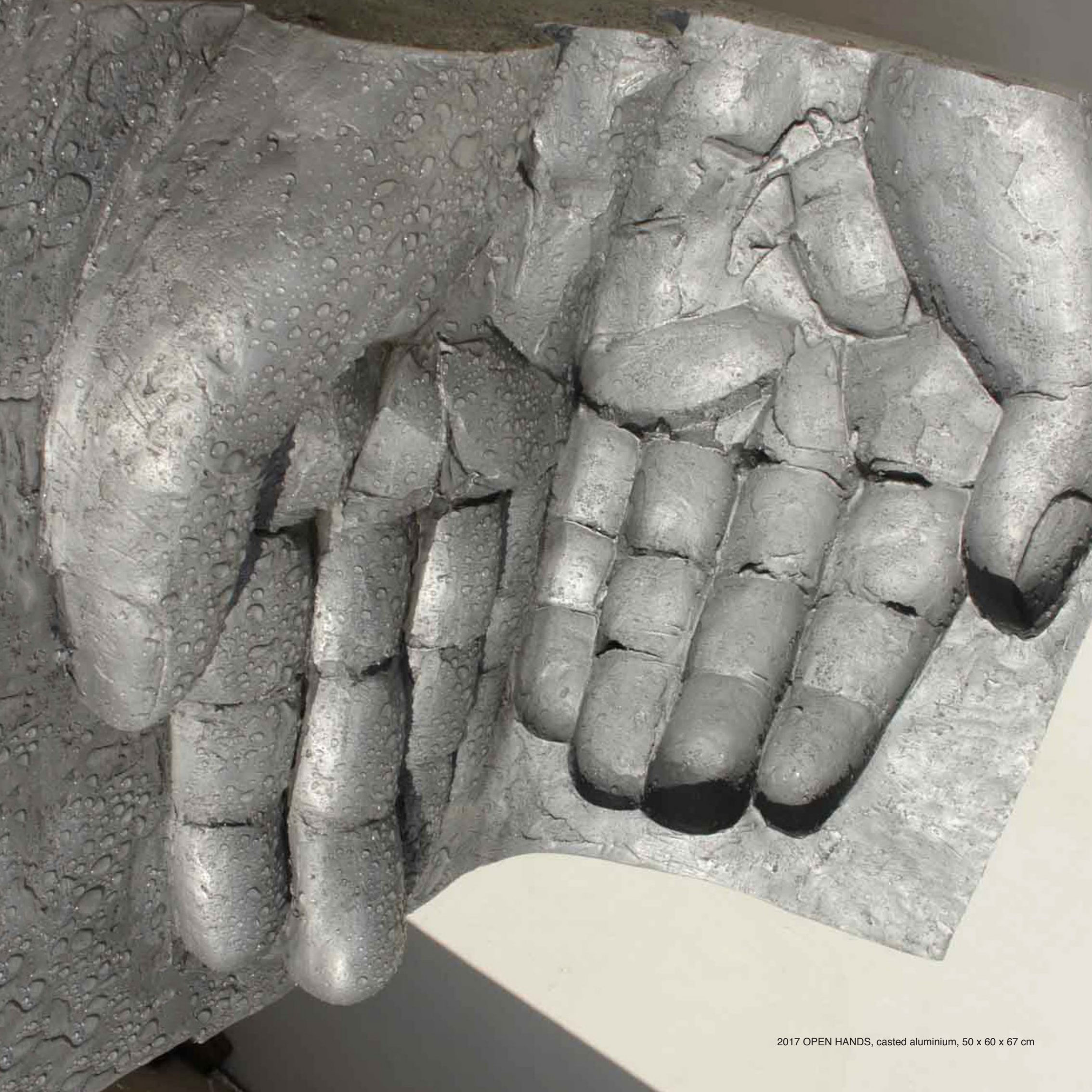
2017 OPEN HANDS, casted aluminium, 50 x 60 x 67 cm