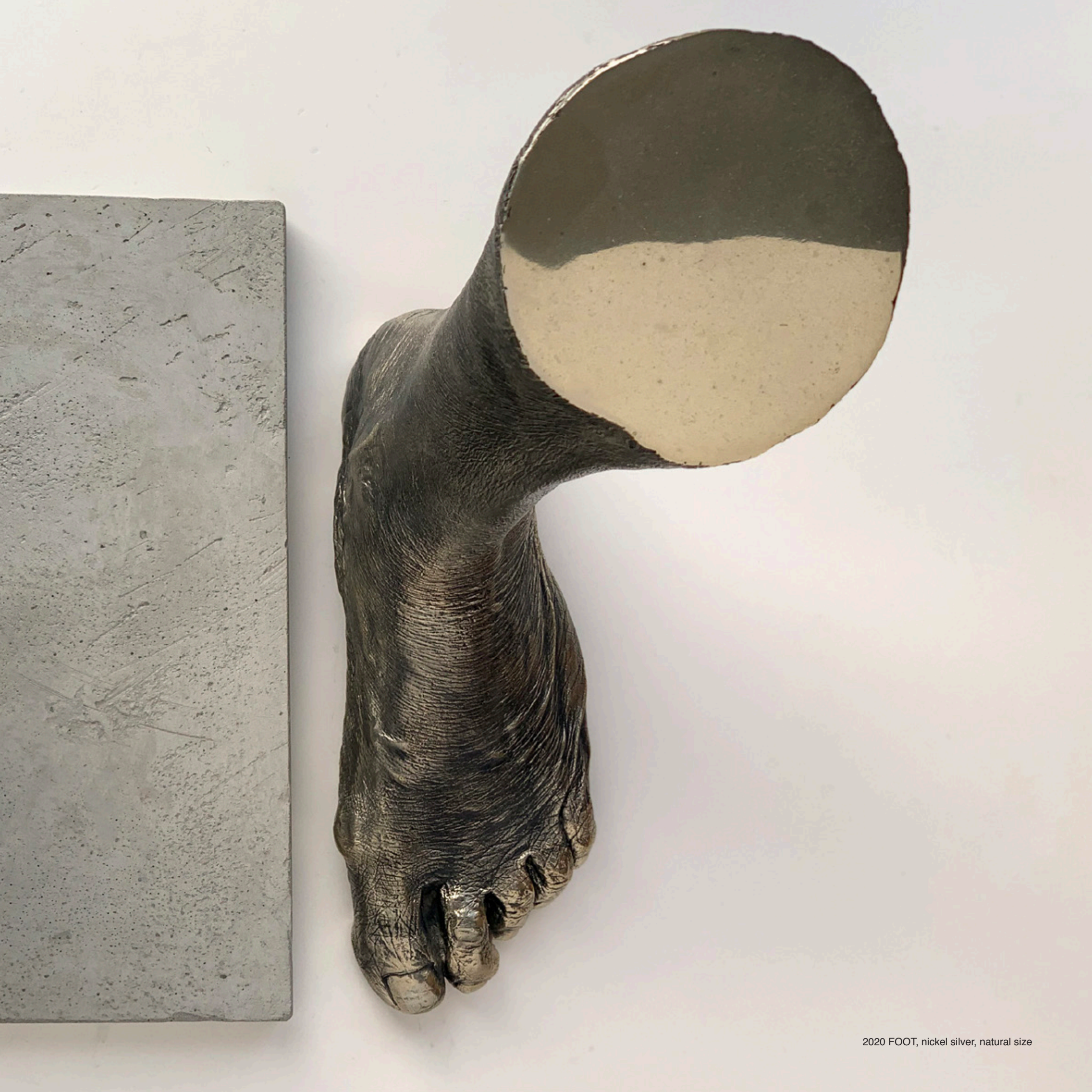
2020 FOOT, nickel silver, natural size